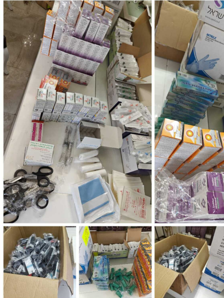
Each kit costs $250

If you would like to help provide Emergency Aid Kits for the volunteers, please read below.