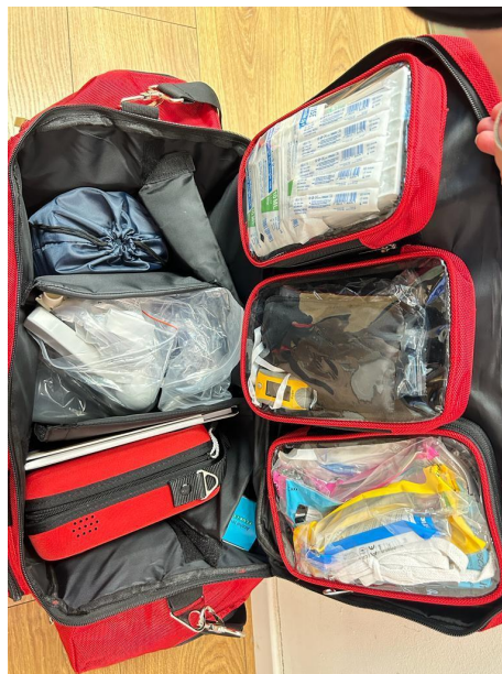
An Emergency Aid Kit

Additionally, JCT is providing crisis intervention training for psychological trauma, offering immediate support to prevent PTSD. JCT is extending training to its staff and students, and opening it to the public, emphasizing basic life-saving skills both for critical care and crisis intervention.