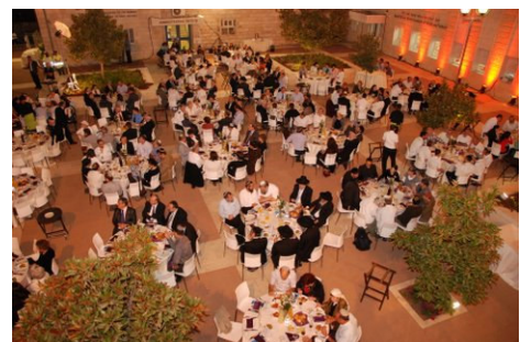
View of Dinner Guests