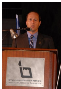
Mayor Nir Barkat